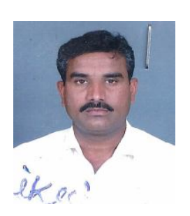
Profile - WCS Partner I Integrated Pest Management Agriculture And Rural Development Society (IPMARDS)