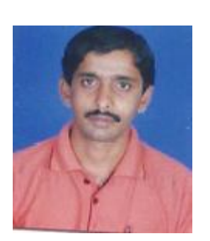
Profile - WCS Partner VIII

SARVODAYA GRAMINA ABHIVRUDDHI TRUST, Samudaya Bhavan Road, Kankeri, Sorab -577429, Shimoga Dist. Mobile No.: +91-9880808849